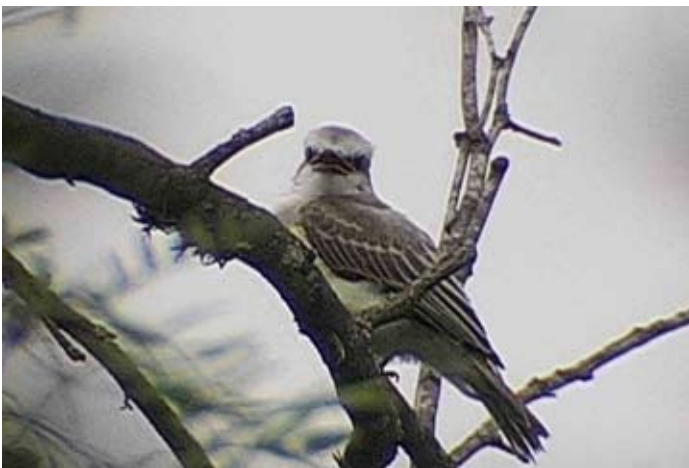
~ frame from video

This juvenal Couch's Kingbird by Malcolm Mark Swan is this month's Bird Photo of the Month. BPM highlights the work of SAAS members. Send us your favorite shot!