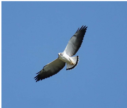
White-tailed Hawk

One of my regrets after nearly 30 years in San Antonio is that it took me so long to attend the Corpus Christi HawkWatch at Hazel Bazemore Park, an annual event that runs from August 1 st through November 15 th . Somehow I had imagined unending heat and sun, and distant hawks up in the cumulus. Actually, my preconceived notions were accurate, but not the whole story. The park has a spacious, shaded podium from which to observe, a remarkable variety of migrating birds—some of which pass close by—and following fronts in late September/first half of October, you can see raptors by the thousands and tens of thousands. Paradoxically, one of the more easily observed species during the hours spent at the count is the non-migratory White-tailed Hawk ( Geranoaetus albicaudatus ), resident in the Corpus Christi area.