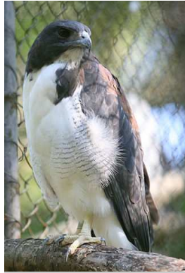
White-tailed Hawk By Snowmanradio

White-tailed Hawks are primarily dark in color and have longer tails than the adults; adult plumage is attained by the third year. Young birds may remain on their parents' territory until being chased away when breeding commences the following year.